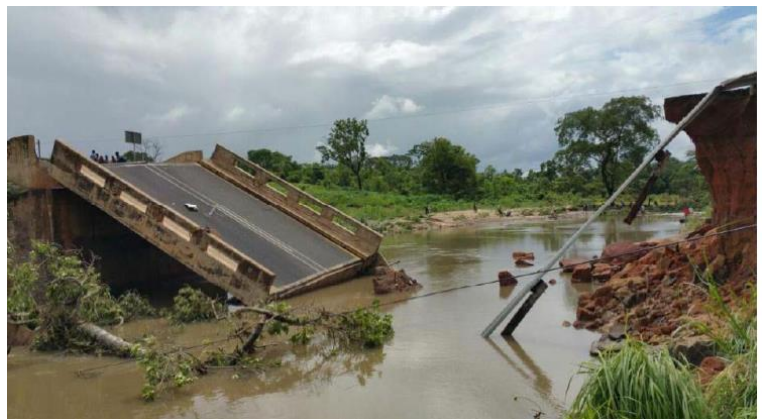
Bridge over Namilate River, 58km from Mocuba

On 19 January 2015, the Government requested immediate assistance from in-country humanitarian partners, in accordance with the Contingency Plan. In response, the UN is rapidly preparing a request to the OCHA-managed Central Emergency Response Fund