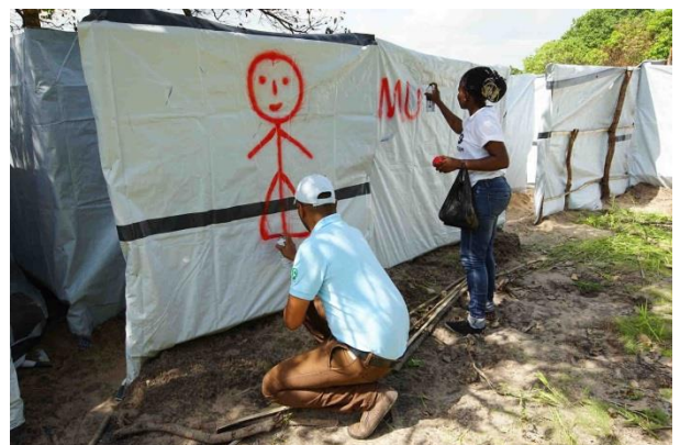
Accommodation center in Cajual, Mocuba. Latrine construction.