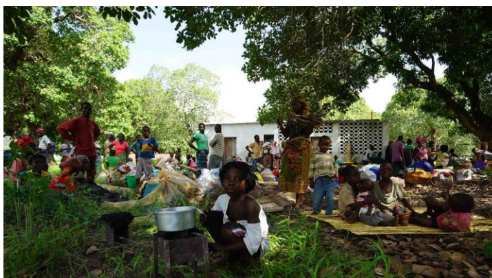
Accommodation center in Cajual, Mocuba. A young displaced girl with family, cooking.