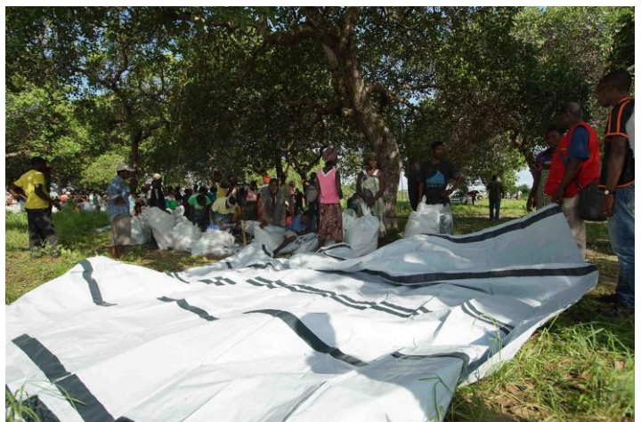
Accommodation center in Cajual, Mocuba: Setting up tents.