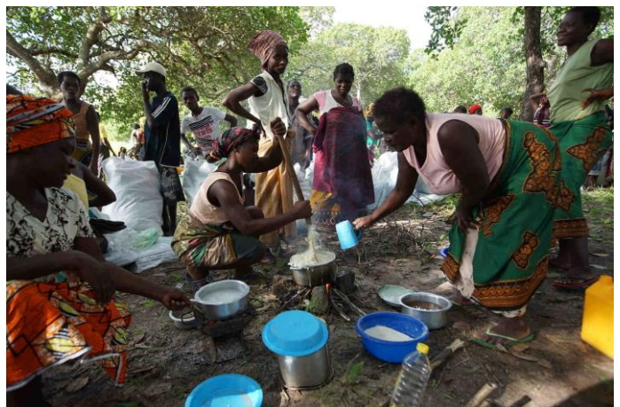
Accommodation center in Cajual, Mocuba: Women at the camp cooking.